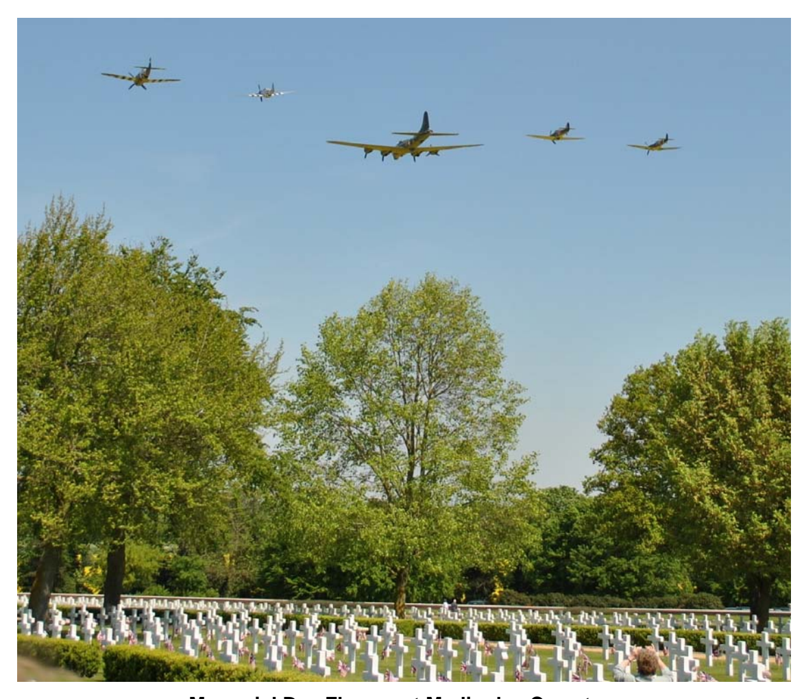
Memorial Day Flyover at Madingley Cemetery